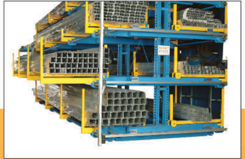
Hanged Arm Tube Rack Model